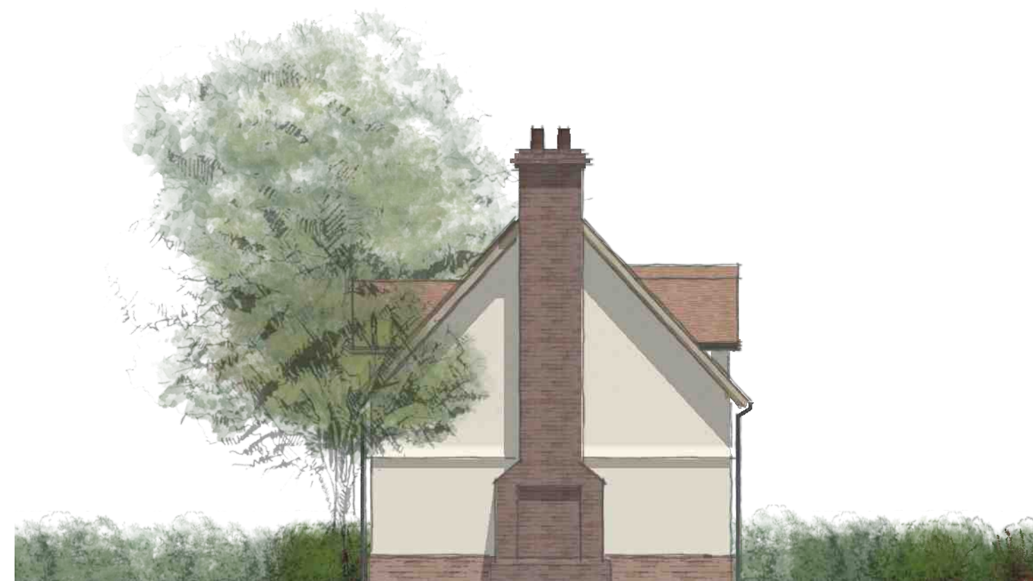
SIDE R ELEVATION