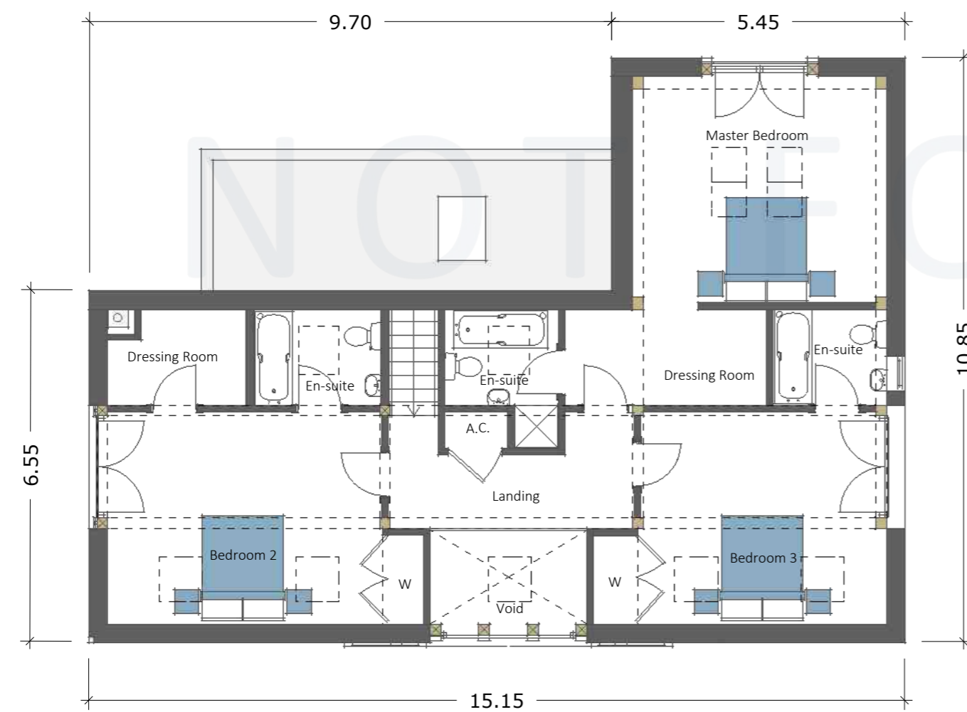
FIRST FLOOR GEA- 122.70 m 2