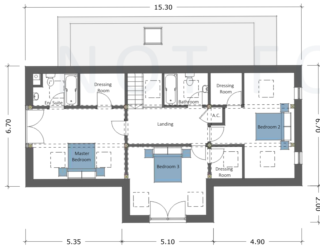
FIRST FLOOR GEA- 112.20 m 2