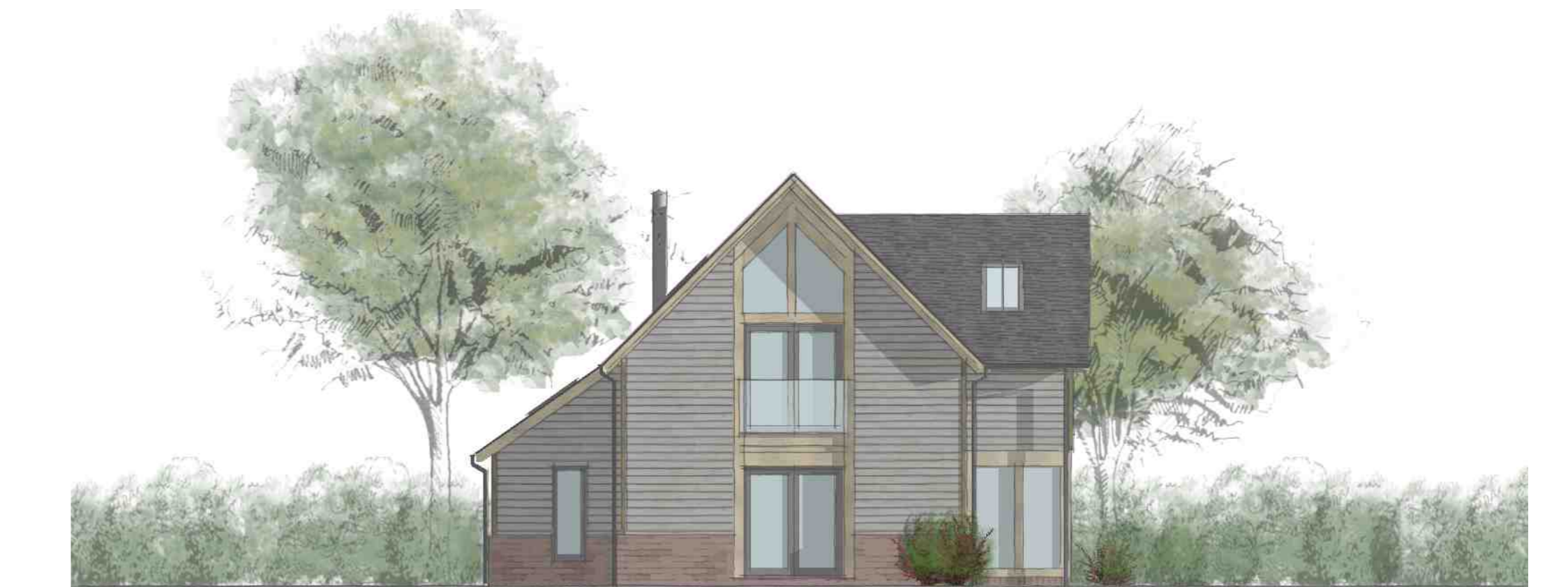
SIDE L ELEVATION