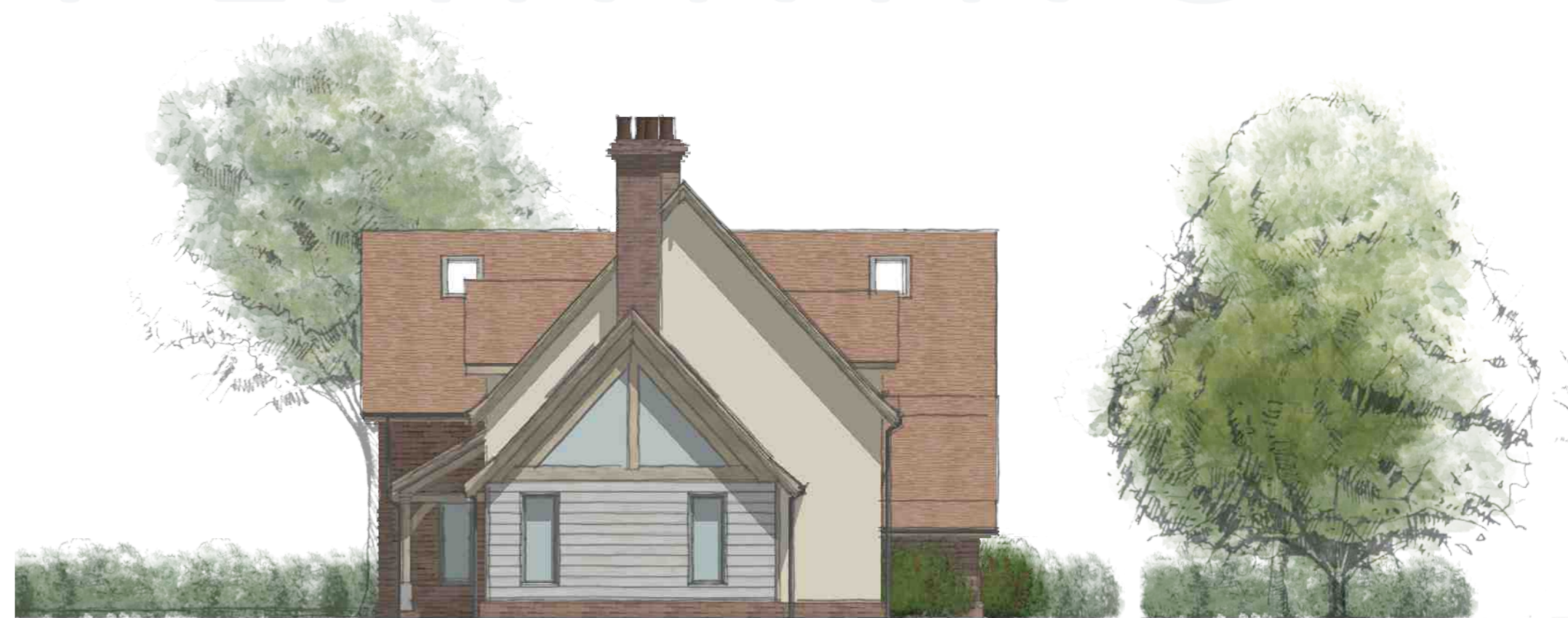
SIDE L ELEVATION