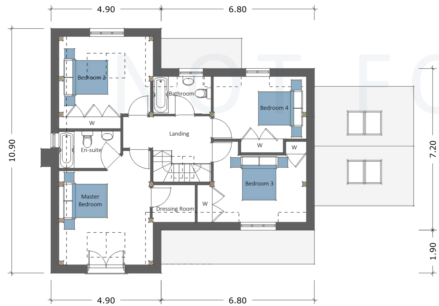
FIRST FLOOR GEA- 102.60m 2