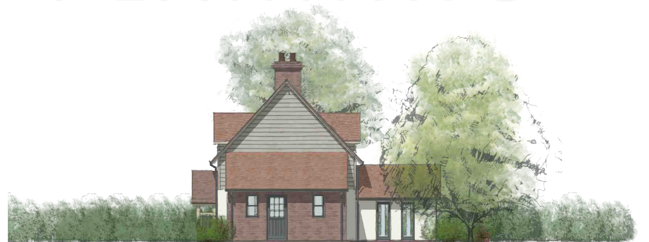
SIDE R ELEVATION