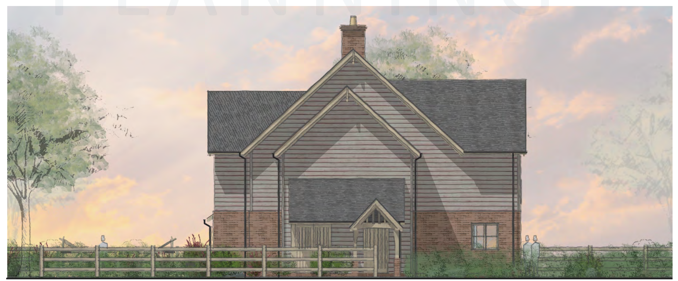
SIDE R ELEVATION